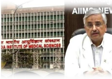
Prof Randeep Guleria, MD, DM Former Director, All India Institute of Medical Sciences, New Delhi Advisor, Princeton Foundation for Peace and Learning

We are now expanding our endeavor across the globe to strengthen the healthcare systems under the guidance and supervision of global experts. This will enhance donations and shipping of philanthropic medical supplies including medicines, vaccines, and other medical products from anywhere in the world to anywhere needed. This structured and streamlined endeavor works on the principles of the 'economy of scale' as well as 'economy of scope' and bolsters the conglomeration of Government-Corporation-