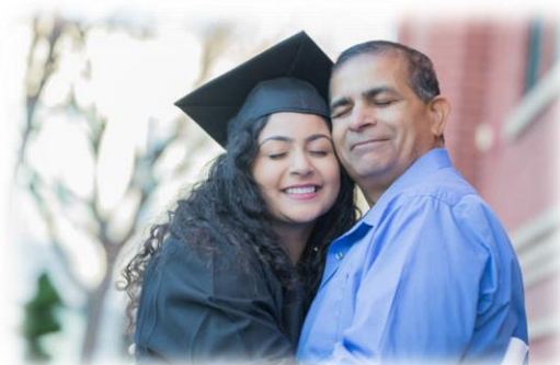
Women Empowerment through Education