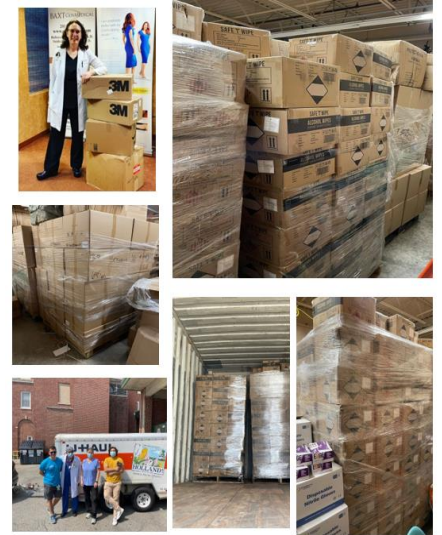
Princeton Foundation organized shipping of covid supplies from US donors to India

"Covid pandemic has posed substantial technical and ethical challenges highlighting the urgent need of enhanced collaboration amongst healthcare professionals across the globe to further strengthen the healthcare systems. Such multilateral knowledge and resource sharing is key to bolster global endeavors in managing communicable as well as and non-communicable diseases."